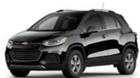
Mosaic Black Metallic