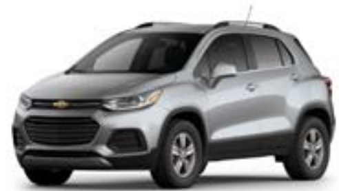
Silver Ice Metallic