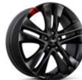
18" Black-Finish Aluminum Wheels with Red Accent Stripes Available on LT with Redline Edition