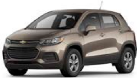
Stone Gray Metallic