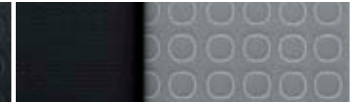
Light Ash Gray Cloth (shown)