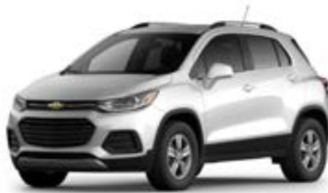
Iridescent Pearl Tricoat 1