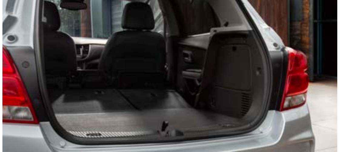
48.4 cubic feet of maximum cargo space 2