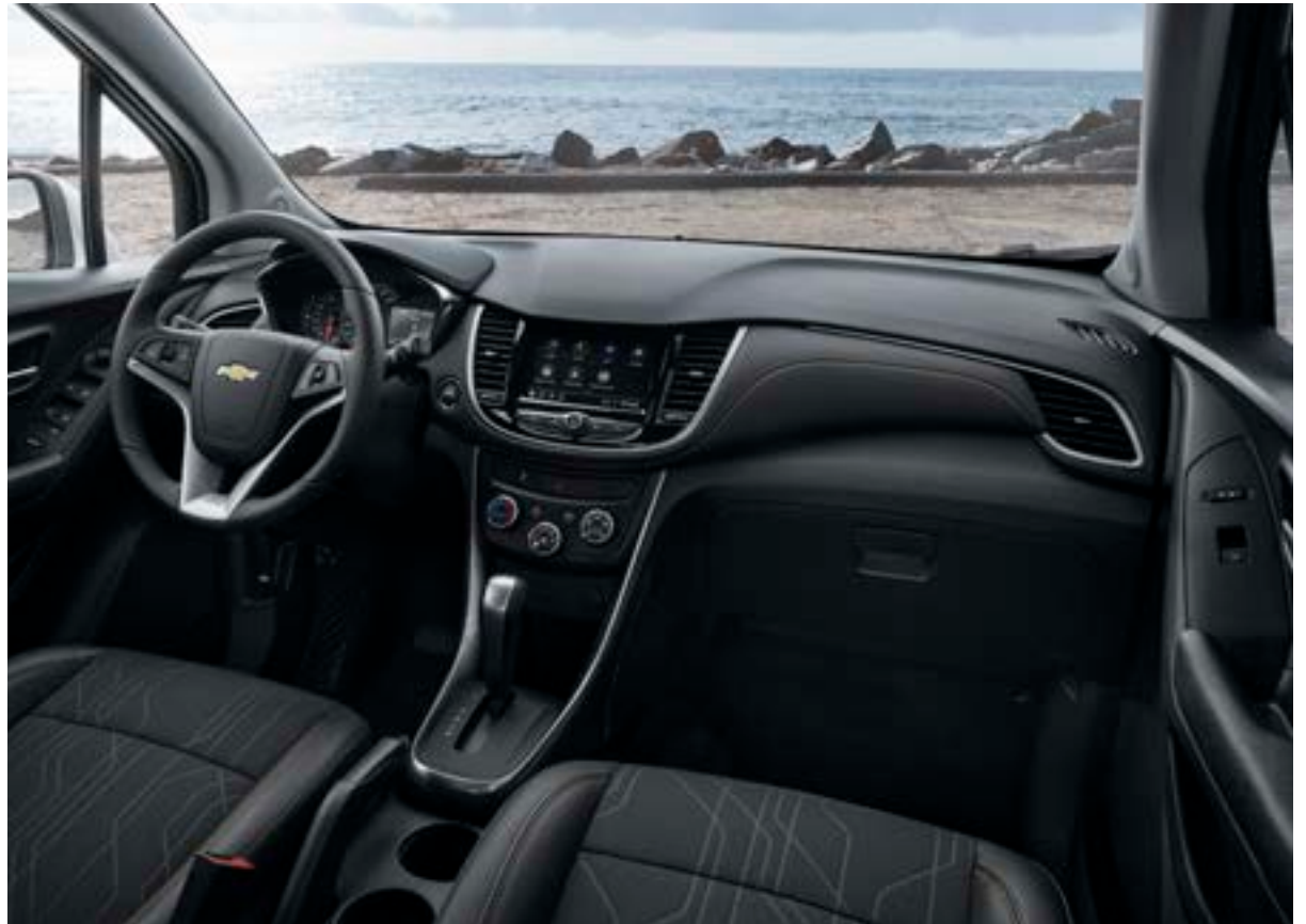
Trax LT interior in Jet Black with available features.

Compact dimensions and maneuverability make it ideal for slipping in and out of tight parking spaces or navigating narrow streets. The new 1.4L Turbo engine offers more horsepower and torque than the previous powerplant. Inside, there's plenty of room for you and four friends. Or take advantage of the fold-flat rear seats when you want to bring some cargo along. Put it all together for a small SUV that's large enough for you to live your biggest life.