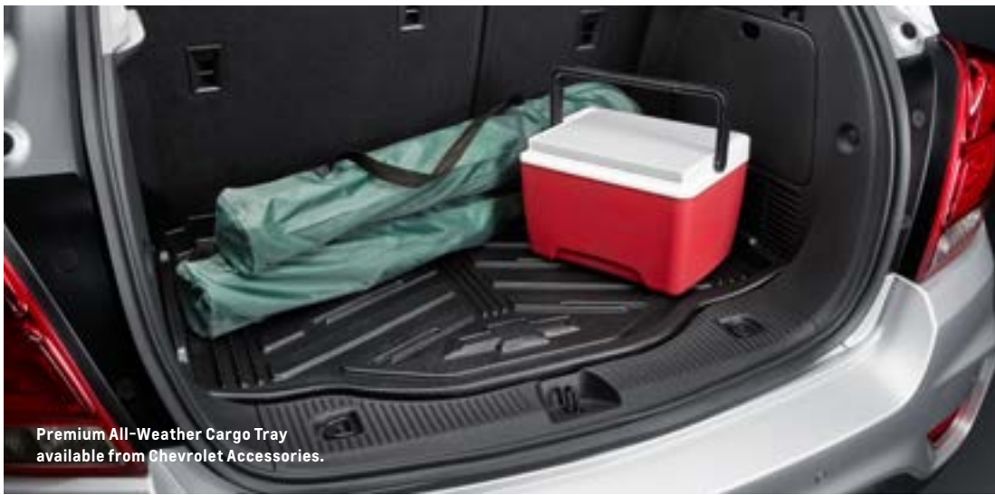
Premium All-Weather Cargo Tray available from Chevrolet Accessories.