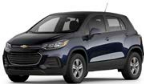
Midnight Blue Metallic