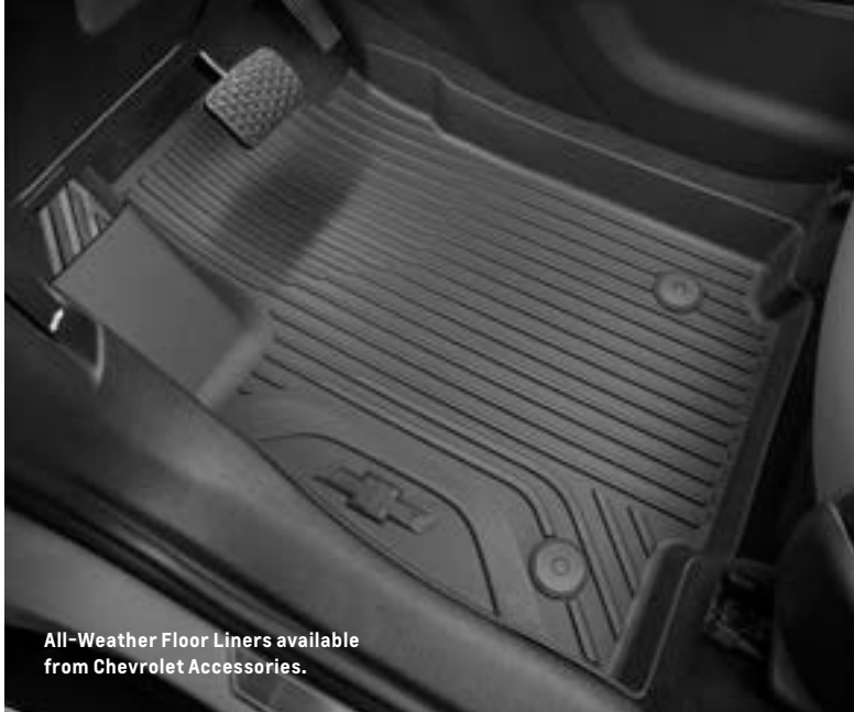
All-Weather Floor Liners available from Chevrolet Accessories.