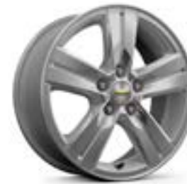
16" Aluminum Wheels Standard on LS