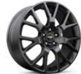
18" Gloss Black Aluminum Wheels Available on LT with Midnight Edition or Sport Edition