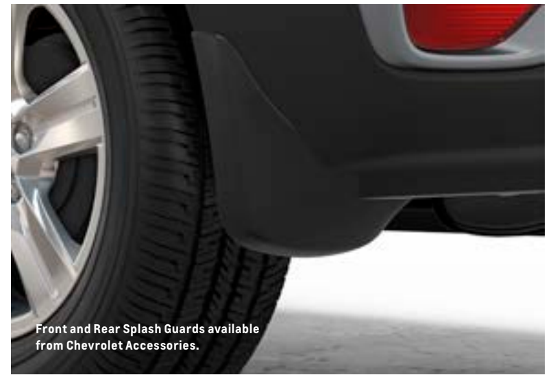
Front and Rear Splash Guards available from Chevrolet Accessories.