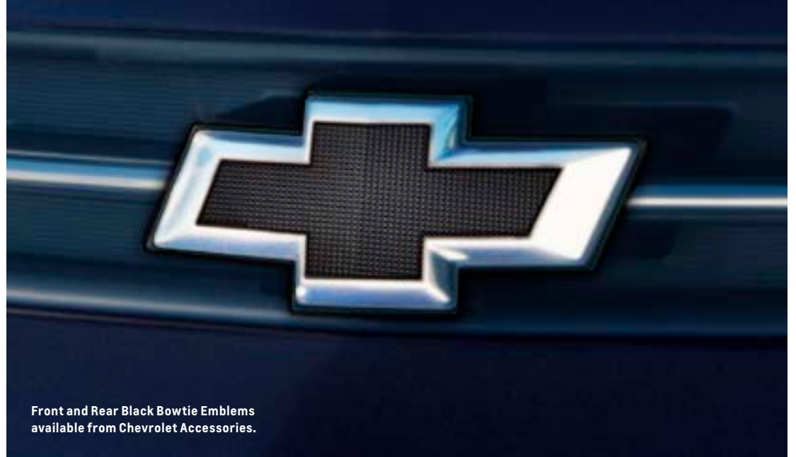
Front and Rear Black Bowtie Emblems available from Chevrolet Accessories.