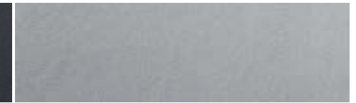
Light Ash Gray Leatherette Seating Surfaces 2