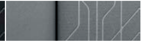
Light Ash Gray Deluxe Cloth/Leatherette Seating Surfaces