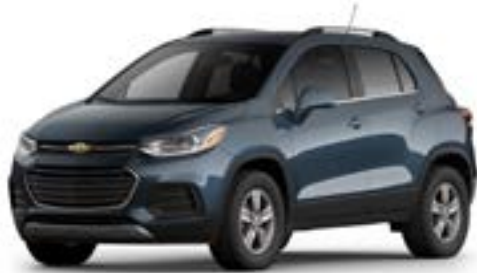
Shadow Gray Metallic