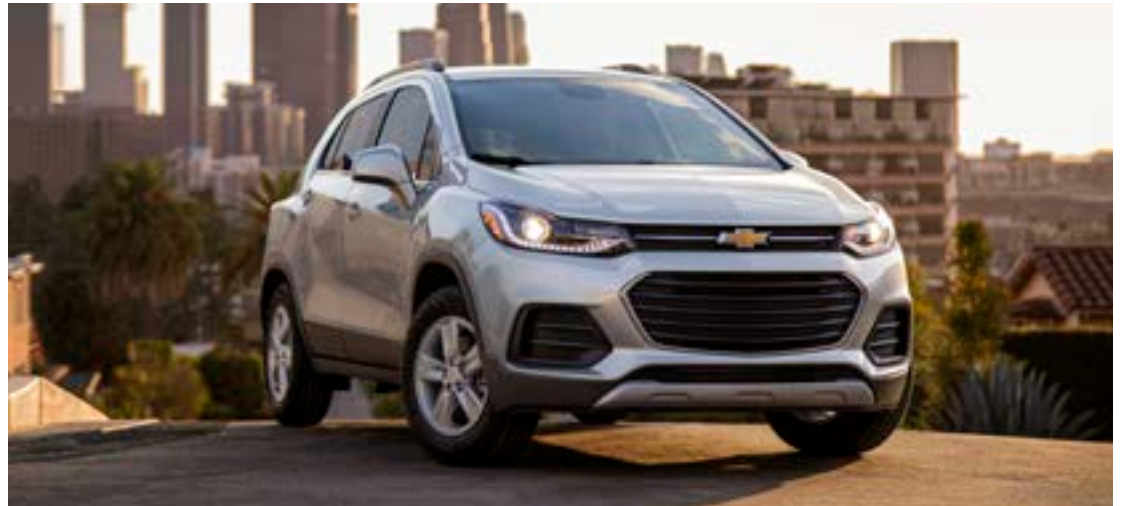
Trax LT in Silver Ice Metallic.

1 EPA-estimated 24 MPG city/32 highway (FWD). EPA-estimated 23 MPG city/30 highway (AWD). 2 Cargo and load capacity limited by weight and distribution. 3 Vehicle user interface is a product of Apple and its terms and privacy statements apply. Requires compatible iPhone and data plan rates apply. 4 Vehicle user interface is a product of Google and its terms and privacy statements apply. Requires the Android Auto app on Google Play and a compatible Android smartphone. Data plan rates apply. You can check which smartphones are compatible at g.co/androidauto/requirements . 5 Service varies with conditions and location. Requires active service and paid AT&T data plan. Visit onstar.com for details and limitations. 6 A NOTE ON CHILD SAFETY: Always use seat belts and the correct child restraint for your child's age and size, even with airbags. Even in vehicles equipped with the Passenger Sensing System, children are safer when properly secured in a rear seat in the appropriate infant, child or booster seat. Never place a rear-facing infant restraint in the front seat of any vehicle equipped with an active frontal airbag. See your vehicle Owner's Manual and the child safety seat instructions for more safety information. 7 2015–2022 model years. Government 5-Star Safety Ratings are part of the National Highway Traffic Safety Administration's (NHTSA's) New Car Assessment Program ( www.nhtsa.gov ).