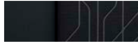
Jet Black Deluxe Cloth/Leatherette Seating Surfaces