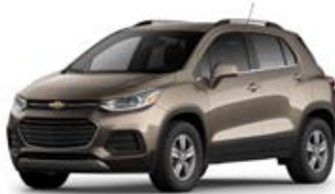
Stone Gray Metallic