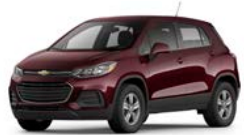
Black Cherry Metallic