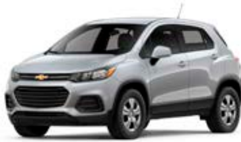
Silver Ice Metallic