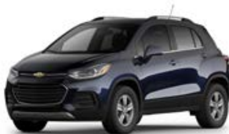
Midnight Blue Metallic