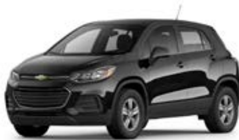
Mosaic Black Metallic