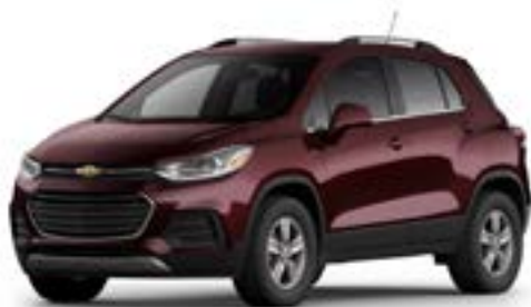
Black Cherry Metallic