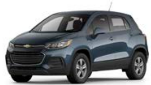
Shadow Gray Metallic